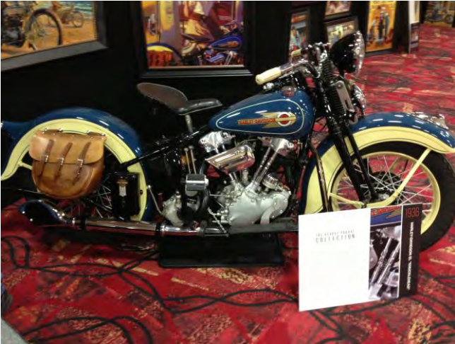
Second biggest bidders brawl. A beautifully restored 36 EL With some very good provenance sold at $165K. Thin Air!