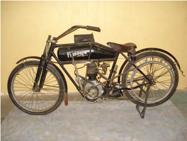
Early Flanders single cylinder belt drive in original form except paint.