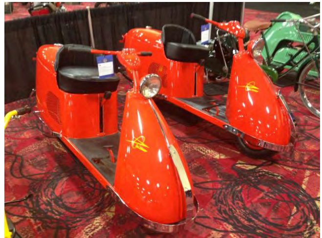
A pair of Salisbury Scooters in beautiful condition.