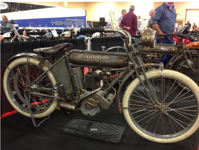
1913 Arrow (Marsh Metz) A Mecum Auction No Sale at $40,000.