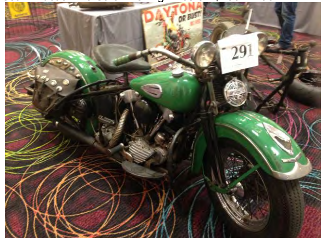
1940 EL in original condition. Special ordered from factory. Biggest two person bidding brawl at $140K. Shock attack!