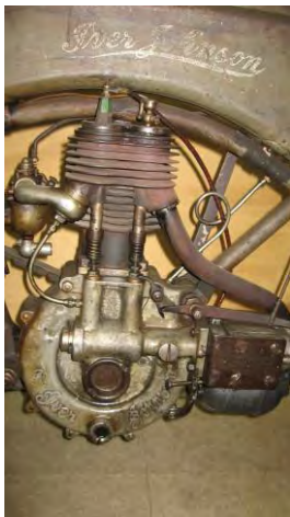
An Iver Johnson engine