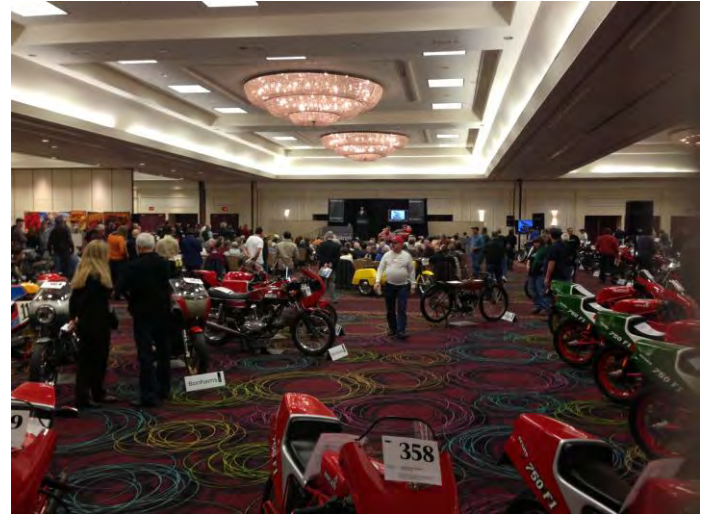
Bonham's Auction in Vegas January 9 th