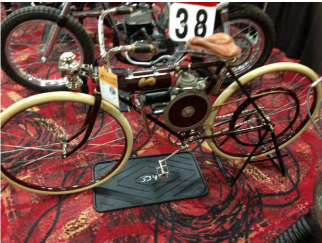
A 1913 Fairy. A child's sized motorcycle. Sold for $20K Only one known to exist. Workmanship was spectacular.