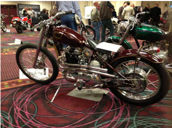
Cocky little Trumpet at Bonham's Auction. Notice the Rear Hub