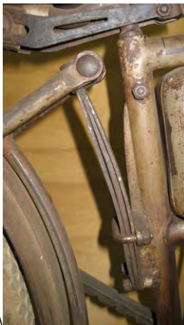
Iver Johnson rear suspension