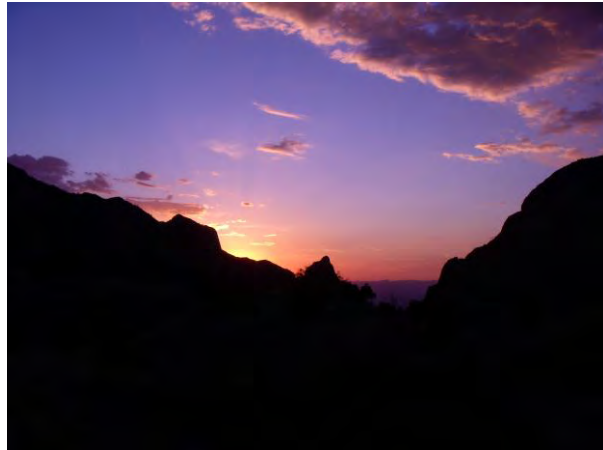
Actual Photos taken from the 2010 Texas National Road Run. Just beautiful country to ride with photo opportunities around every corner.