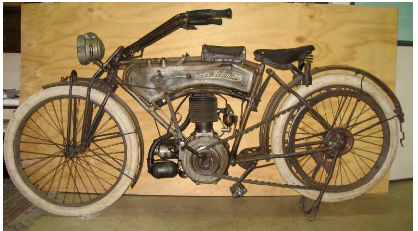
"Dear God... Please let me barn find one of these."