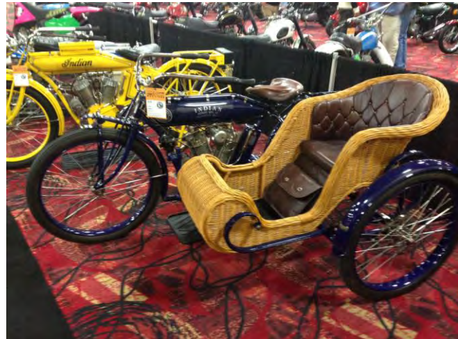
1910 Indian Big Twin with Wicker Side Car. Art Attack!