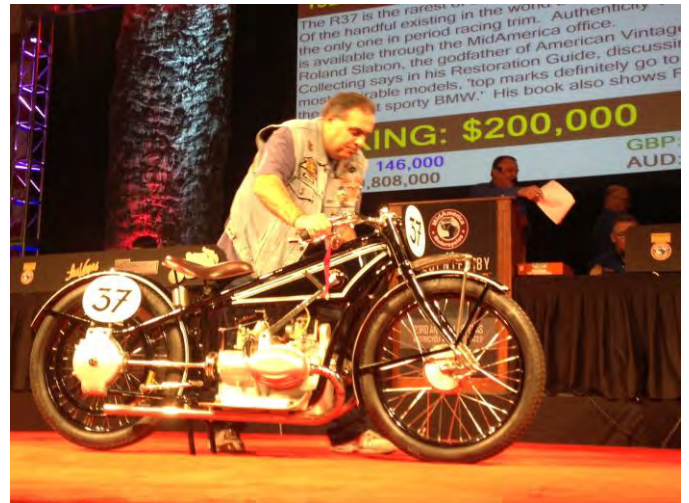
A Mecum Auction No Sale! Asking Price of $250K. 1937 BMW R37