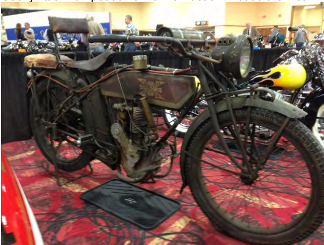
Original Paint 1914 Excelsior sold at Mecum's $62,500 (+ fees)