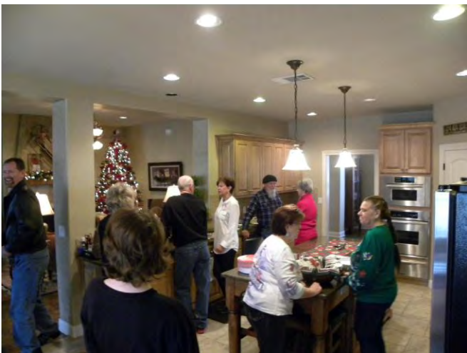
Someone always in every room.