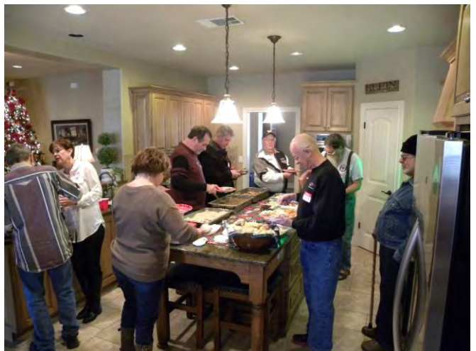
Dig In! Homemade chicken, salads, sweet potatoes, + deserts.