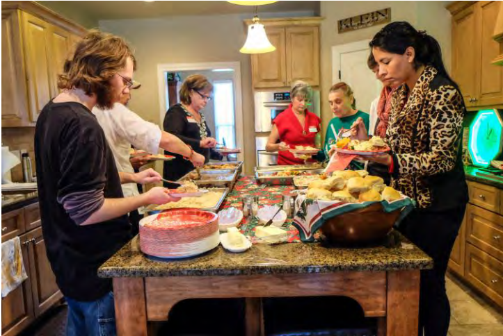
Time to Eat