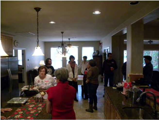
The kitchen early in the day.