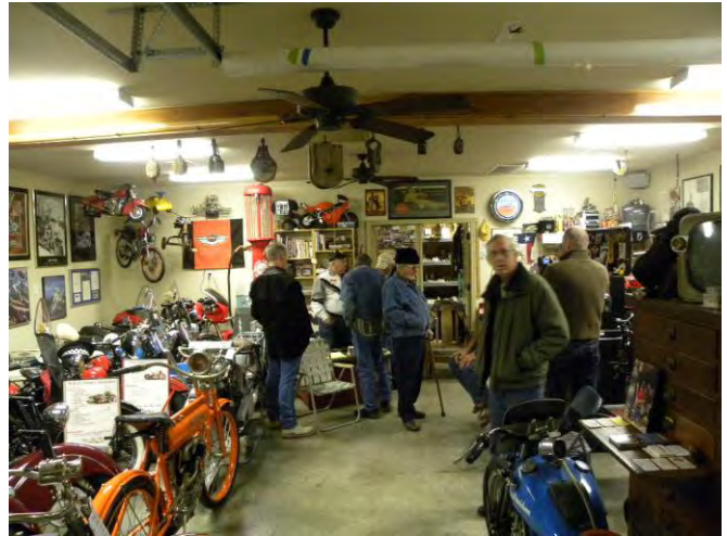
The Escape to The Shop.... Certainly no BS spoken here?