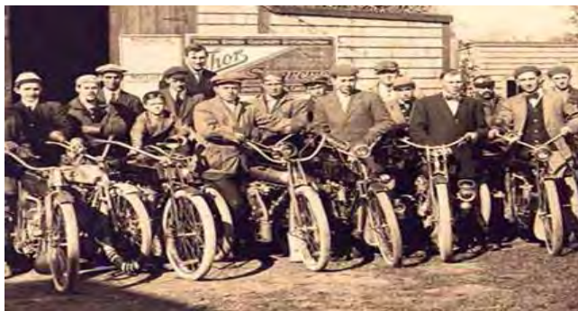
Not a recent club picture. However our members could recreate it. They have the machines 😊