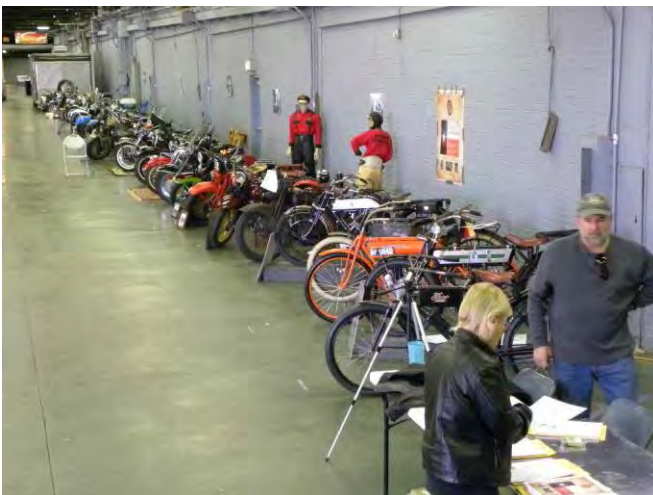
A 200 ft. long row of machines at OKC Bike Show!