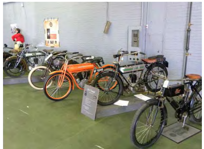
The Pre-teens / Teens, 08 Thor, 11 BSA, 11 Merkel, 14 HD