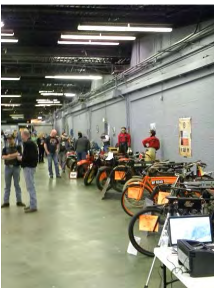
Biggest Display at the OKC Bike Show