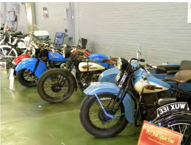
Wow! More 30's and 40's rides ready to go!