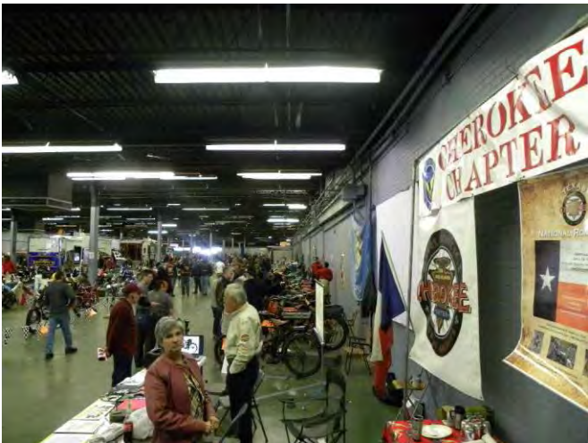
Cherokee Chapter / AMCA Booth was a constant stopping point for people interested in Vintage Motorcycles