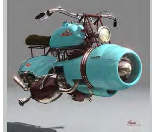
AMCA Vintage Bike Show 2080?