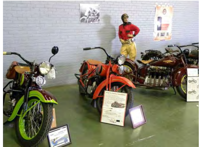
Sitting Pretty! A 33 VLH, 32 VL, 30 KJ Henderson Four