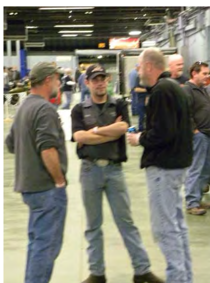
Cannonball Planning Session