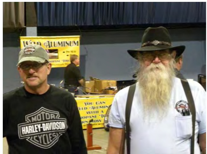
To shave or not to shave? What is the rule in our Chapter?