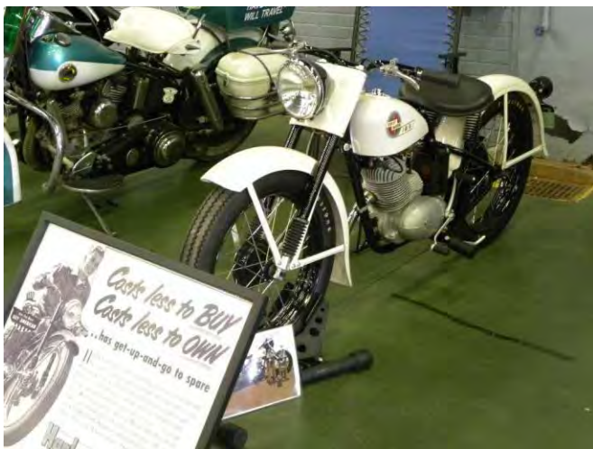
Jerry and Liesel's perfect Hummer Display