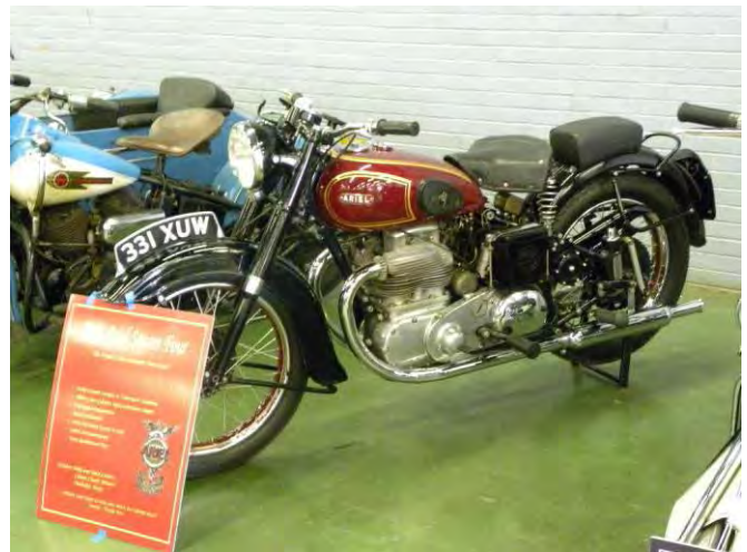
Butch Hudkins beautiful Ariel