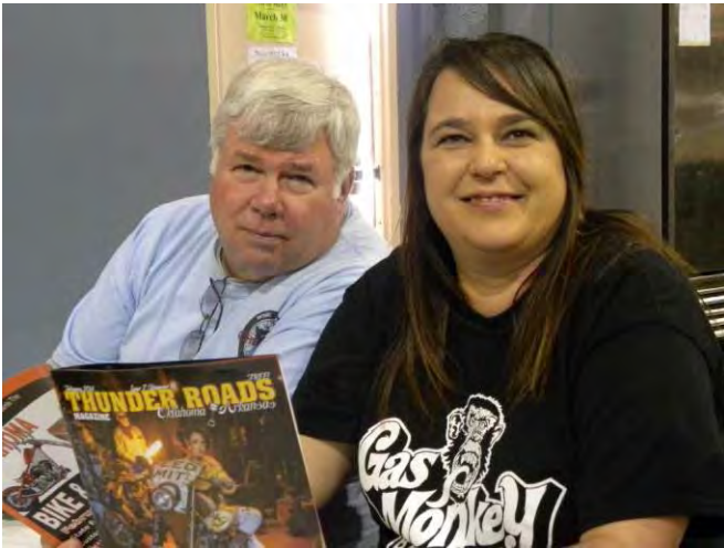
Members gathering in anticipation of the Bike Show Awards Ceremony