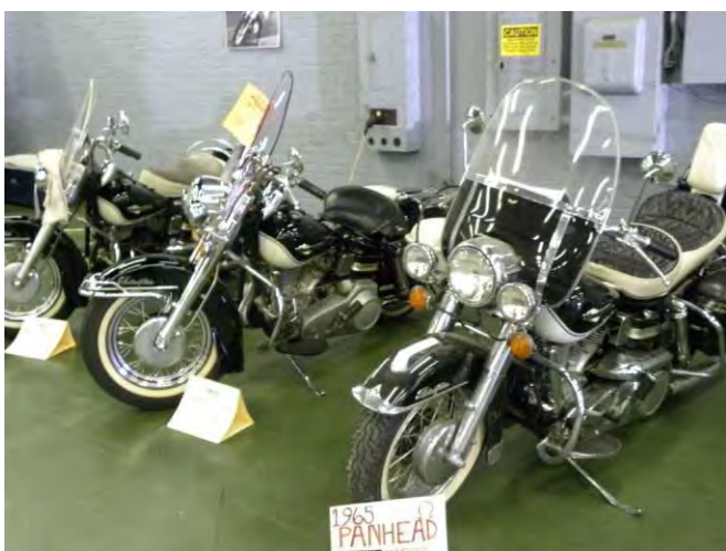
Three 65 Pans all dressed up in tuxedo's!