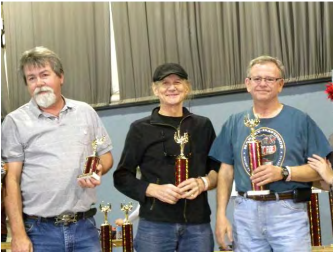
5 more trophies go home with "Cherokee People"