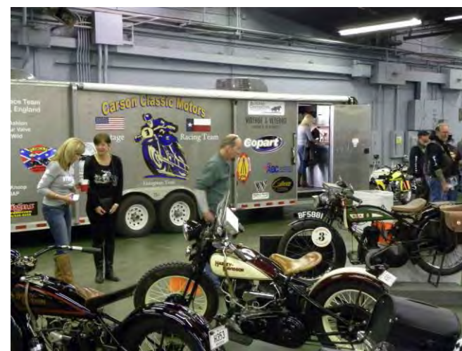
The Cannonball Display – Carson Classic Motors