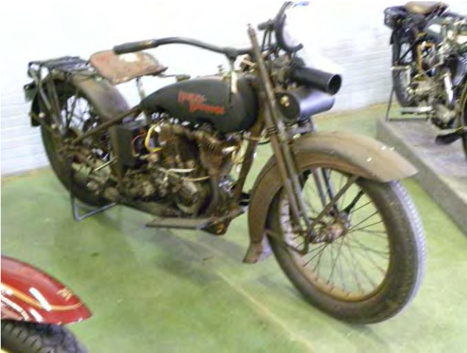
Several 20's J Models were in attendance