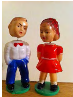
Don't be a Bobblehead... Register Now!