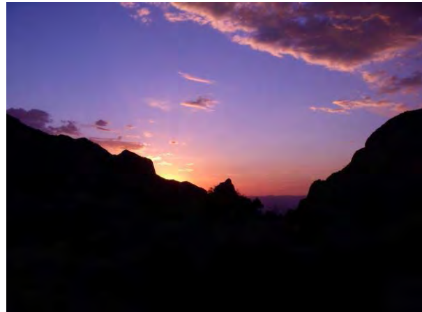
Actual Photos taken from the 2010 Texas National Road Run. Just beautiful country to ride with photo opportunities around every corner.