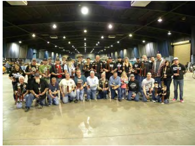
This was Our Entourage. 35 Cherokee Members at OKC

This is what it is all about...People Make Clubs... Clubs don't make people!