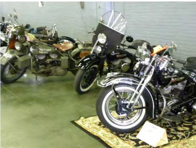
The 40's were well represented!