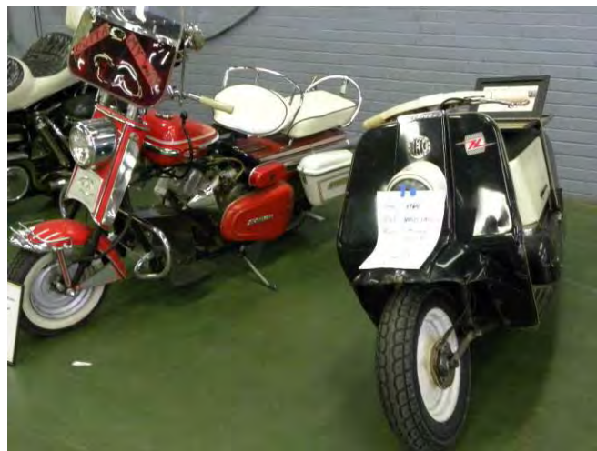
Susie Burch's Lil Kicker and JoAnn Kugle's original Topper The ladies scooters were a big hit all weekend