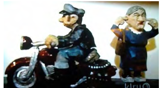
Fire Up and Come to The Texas Road Run!