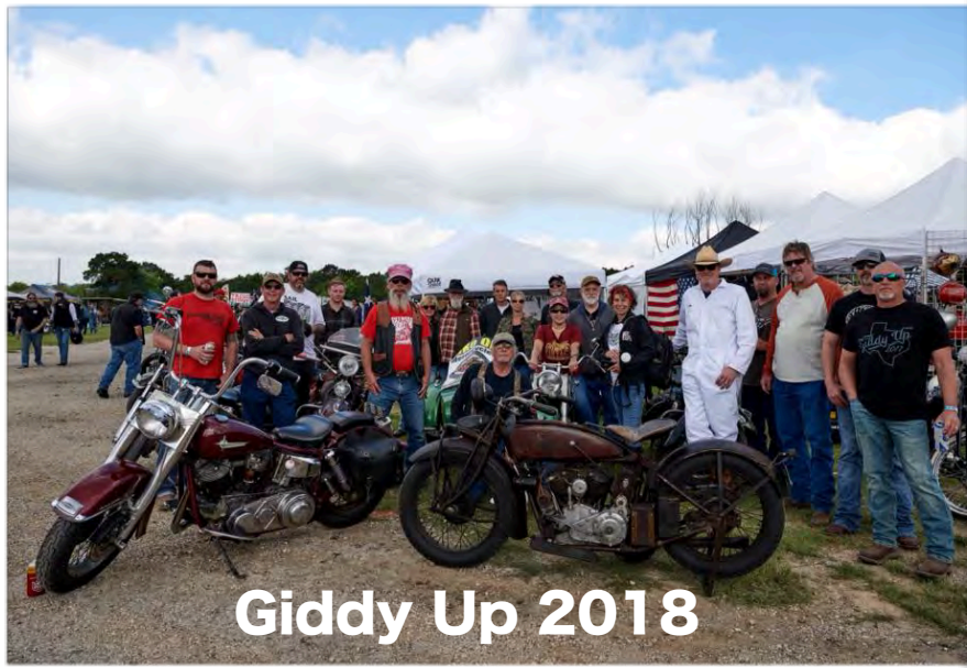
Giddy Up 2018