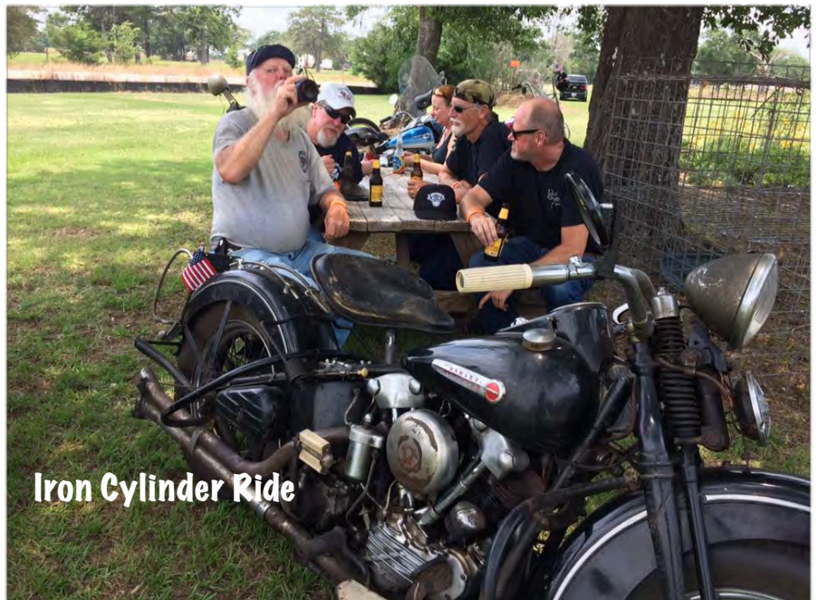
Iron Cylinder Ride