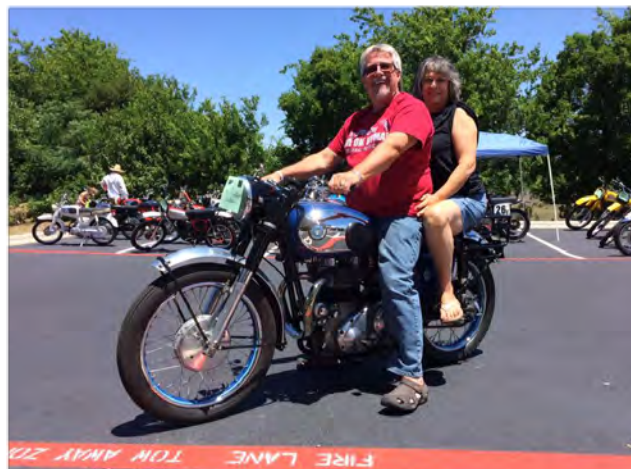
Central Texas Powersports