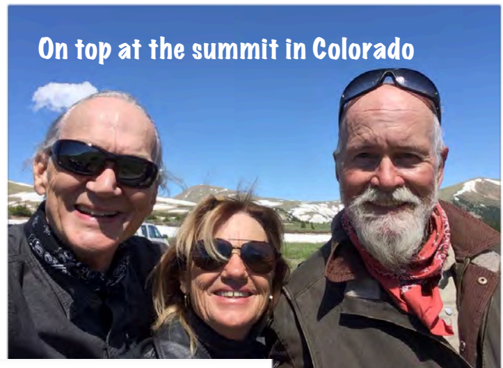
On top at the summit in Colorado