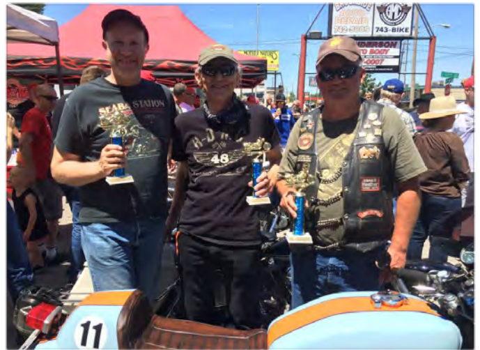
Oklahoma members ride from OKC to Tulsa